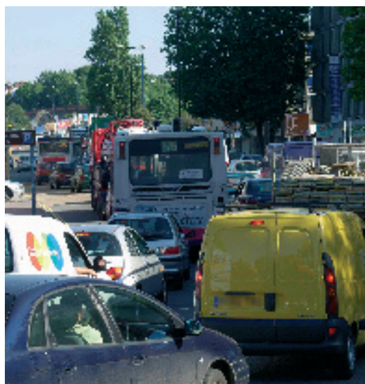
Traffic in central Bristol