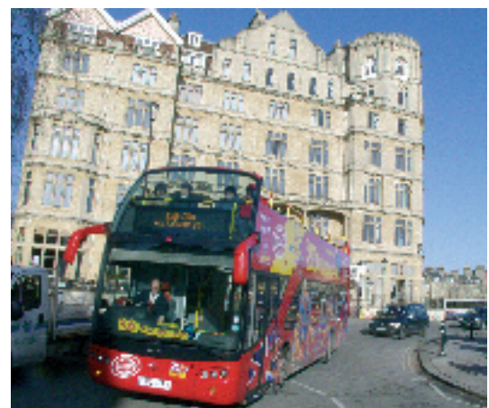
Tourist bus in Bath

Although tour buses do not operate in the AQMA in Bath they contribute towards air quality issues. An application has been submitted to the Traffic Commissioner to ensure all tour buses operating in Bath meet Euro 4 emission standards. Consideration will be given to applying similar or better emission standards to all buses operating in the area. A public inquiry is likely to be held in March/April 2006.