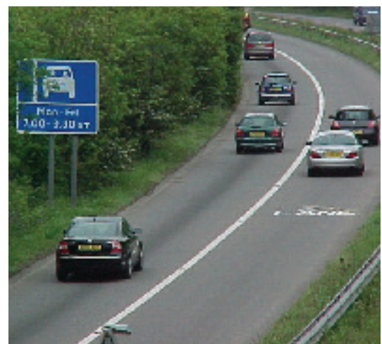
Long Ashton HOV Lane

8.1.4 Whilst efficiency improvements to vehicles will make an impact in the shorter term, with increased traffic growth the sheer volume of traffic starts to outweigh these benefits. All four Councils have undertaken reviews and assessments of air quality under Part IV of the Environment Act 1995. Following this process, parts of Bristol and Bath and North East Somerset are predicted to fail NO 2 NAQS standards. These areas have been declared as Air Quality Management Areas (AQMAs) and specific Air Quality Action Plans (AQAPs) have been produced that set out specific measures to tackle air quality problems.