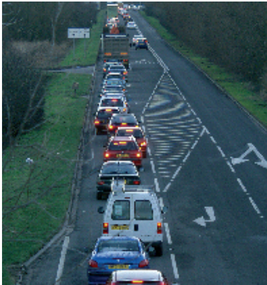
Traffic at Portbury

to address the existing air quality problems, and restrict the potential for air quality problems to develop outside the existing AQMAs. Demand management measures would potentially have significant effects on traffic levels and accelerate progress towards improving air quality.