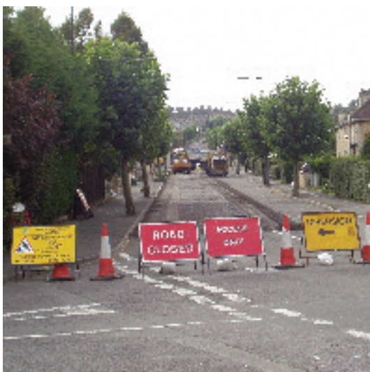
Carriage resurfacing in Bath