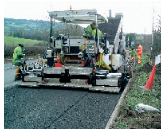
Reconstructing the A38

9.1.2 The JLTP area has a rich heritage ranging from the important historic streetscapes of the World Heritage Site of Bath, to attractive village centres, to stone retaining walls and verges of nature conservation importance in the countryside, to city centres and major shopping areas. High quality maintenance of these assets presents additional challenges.