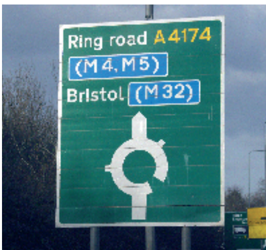
Maintaining the network of signs

We are already members of the South West Highways Management Group, which contributes to the Department for Transport's Roads Liaison Group. This ensures that best practice in asset management is consistently built into our review and benchmarking processes.