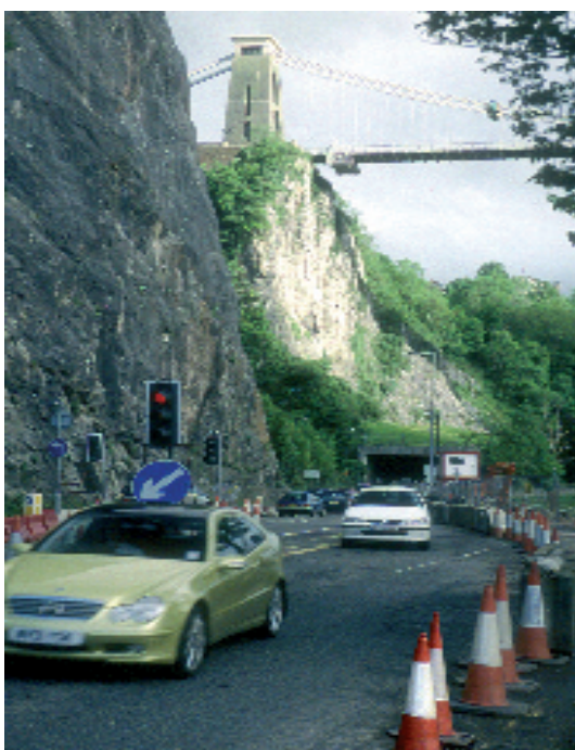
Roadworks on A4 Portway

9.8.2 We will maintain and strengthen bridges and structures with due care and efficiency (go to Box 9D Case Study). As a key part of the JLTP area's highway network, bridges and structures cannot be managed in isolation. We will share best practice on their management where appropriate.