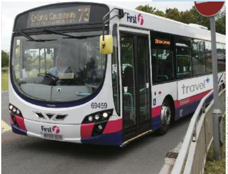
BN0762 Bristol Design Bristol City Council

Service 376 (corridor 6) Bristol to Street via Clutton, Farrington Gurney, Wells, Glastonbury